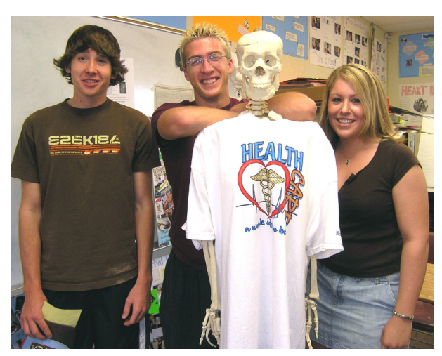
Visit our Website